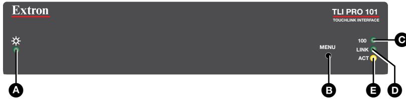
Figure 2. TLI Pro 101 Front Panel