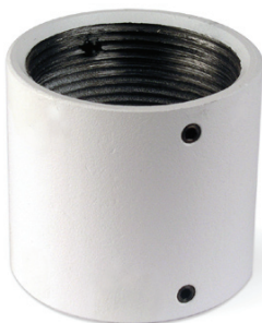
Figure 1 — PCA 100 Pipe Coupling Adapter

WARNING Ensure the complete installation does NOT exceed 500 lbs (227 kg).