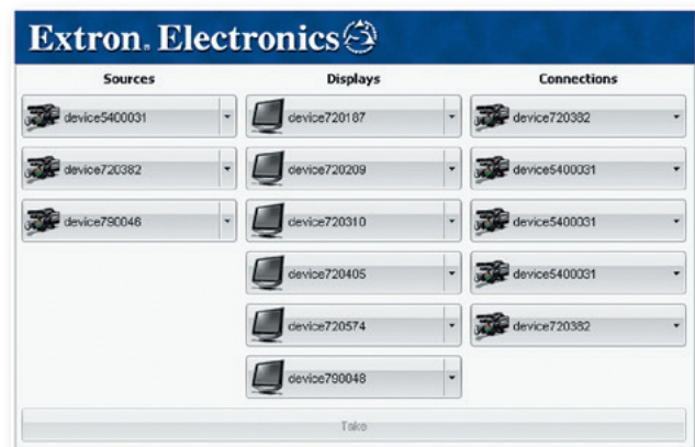
The VNM EC 200 switcher utility connects encoder streams to decoders.

For complete specifications, please go to www.extron.com Specifications are subject to change without notice.