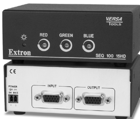
SEQ 100 15HD

The Extron SEQ 100 15HD Skew Equalizer compensates for color separation problems commonly encountered when transmitting high resolution video long distances over data grade Category 5, 5e, or 6 twisted pair cable. Independent time delay adjustments for red, green, and blue color signals enable users to dial in precise color alignments for sharper clearer images.