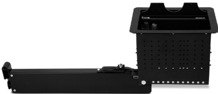
Retractor HDMI shown installed in Cable Cubby 800