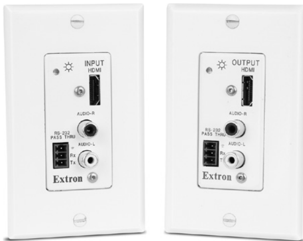
HDMI 201 A D Tx