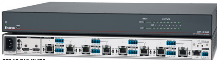
DTP HD DA8 4K 330

The Extron DTP HD DA 4K 330 and DTP HD DA8 4K 330 provide signal extension and distribution to four or eight Extron DTP™-enabled products, sending HDMI, audio, and control up to 330 feet (100 meters) over shielded CATx cable. Both HDCP-compliant DTP distribution amplifiers include several integrator-friendly features that streamline installation and enable the reliable distribution of an HDMI source signal to multiple destinations within DTP Systems.