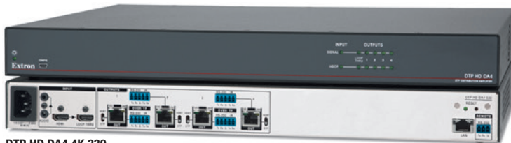
DTP HD DA4 4K 330