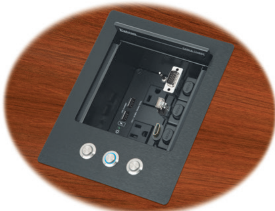
Cable Cubby 500 CCB

The Extron Cable Cubby® 500 is a modular, furniture-mountable cable access enclosure for AV connectivity and power. It accommodates an AC or AC+USB power module and includes mounting brackets for Retractor cable retraction modules, AV cables or AAP - Architectural Adapter Plates. The enclosure's patented modular design allows cables and AAPs to be installed or serviced from the top of the enclosure. For fast installation, the Cable Cubby 500 has a simple, integrated clamp system that quickly secures the enclosure to the furniture surface without the need for additional parts or tools. The Cable Cubby 500 CCB includes buttons that provide convenient control for Extron switchers and other devices that have contract closure control ports. Three brushed stainless steel pushbutton switches feature a raised surface for ease of access and tactile feedback, and LED rings around the switches provide illumination for visual feedback. Power modules are available for the US, Europe, and other major world markets. The Cable Cubby 500 is available in a black anodized or brushed aluminum finish.