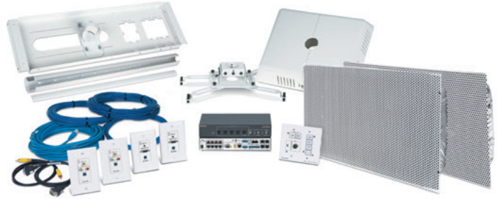
PoleVault is a complete classroom AV switching and control system.