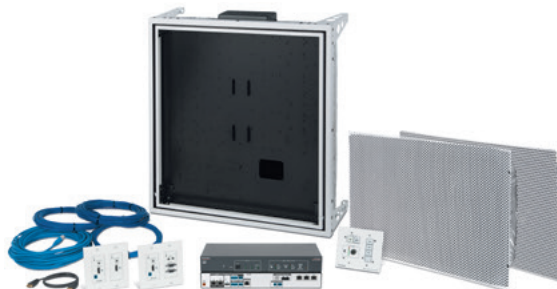
PlenumVault Digital Systems are complete, easy-to-use AV switching and control systems that seamlessly integrate digital and analog video sources.