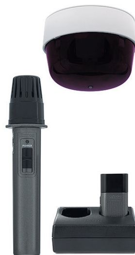
Teachers and students alike appreciate the benefits of the VoiceLift Microphone system.