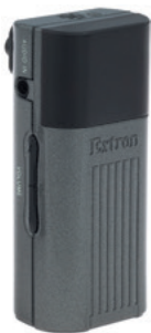
The compact and lightweight VoiceLift Microphone evenly distributes the teacher's voice to all students.