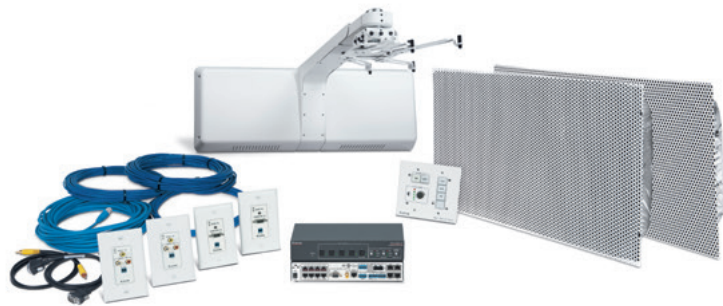
WallVault Systems are easy-to-use, network-enabled, all-inclusive AV switching and control packages, making them ideal for single-display K-12 classrooms.