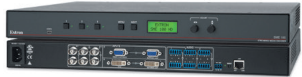
The SME 100 encoder accepts live video and streams it to the campus network.

Many schools broadcast morning news or announcements to provide students, teachers, and administrators with the day's schedule and other important information. This information can be delivered in many different ways, including the school PA system, e-mail, digital signage, or a dedicated internal video broadcast system. Video streaming technology and classroom AV systems provide another method to cost effectively deliver high quality video and audio announcements throughout campus, leveraging the existing network infrastructure.